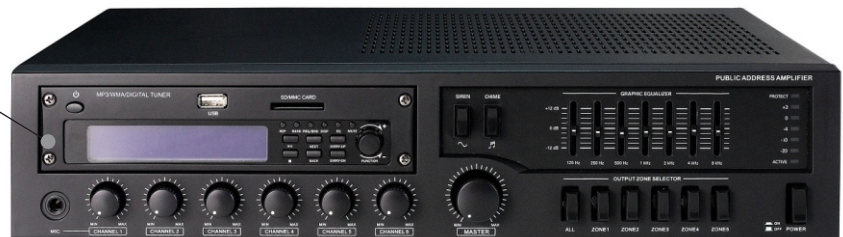
Compact Class-D Amplifier with Source and Call Station

The HN-AS20 is multi-source Tuner/MP3/USB/SD audio source module offering high quality sound reproduction performance of WAV, WMA, MP3, and AAC format audio file from USB and SD player. The assigned function button provides easy control and immediate response to user. HN-AS20 is specially designed for HN-series amplifier. The combination of HN-AS20 and HN-series amplifier makes a best solution for simple applications.