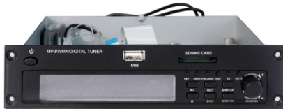
HN-AS20 Integrated Audio Source Module